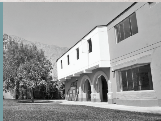
GRACE HOME FOR GIRLS

In Peru, you're empowering and embodying all that World Help stands for—you're giving both help and hope!