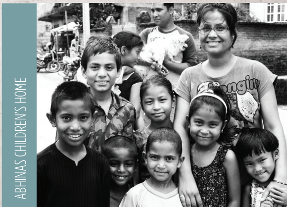
ABHINAV CHILDREN'S HOME

By giving to support church planting, leadership training opportunities, youth programs, and evangelism, you are directly working to bring the heart of the Gospel to Nepal—all while providing spiritual support to existing believers.