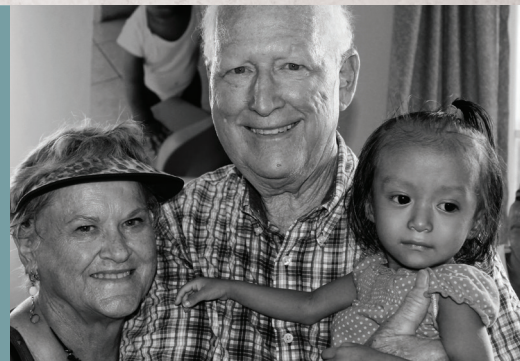
SUNDSTROMS VISITING THE CETNER

YOUR GIFTS TO OPERATION BABY RESCUE HAVE GIVEN CHILDREN AROUND THE WORLD A SECOND CHANCE AT LIFE.