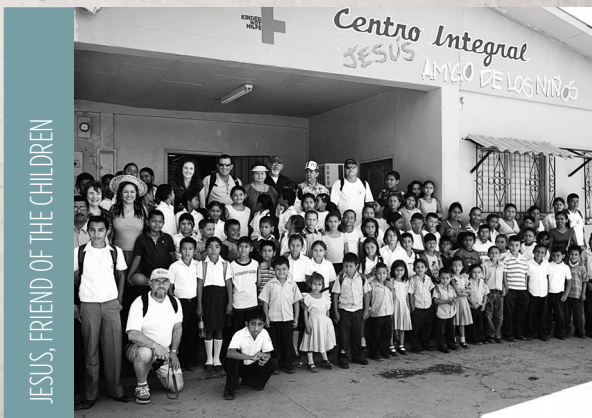
JESUS, FRIEND OF THE CHILDREN

They are so thankful for your involvement and the impact you have chosen to make on the children of Honduras.