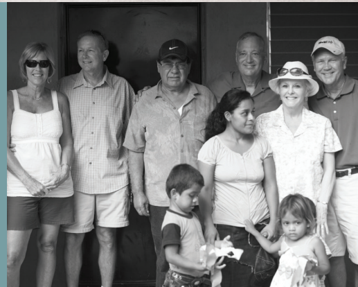
PRESENTING A FAMILY WITH A NEW HOME

Together, we are leaving a legacy of transformation in the nation of Guatemala.