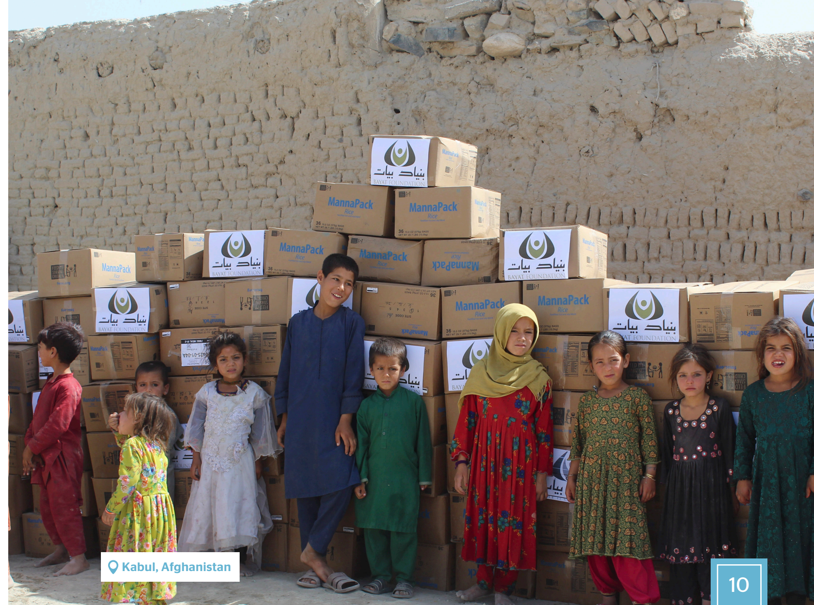
📍 Kabul, Afghanistan

Thank you for being the hands and feet of Jesus to refugees and displaced people in need around the world.